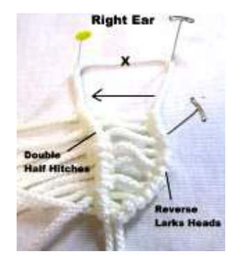
Step 24: Now it's time to make the large ears for your Ganesha Decoration.

Arrange one of the 24-inch cords into the shape of a long triangle, measuring 4 inches tall.