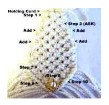
Step 2: Tie 3 rows of Alternating Square Knots (ASK).

Here's a diagram of the steps you will follow as you make the crown for your Ganesha decoration.