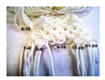
Step 16: Tie 3 rows of ASK.

Step 17: Mentally number the cords 1 thru 24.