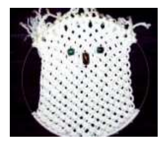
Step 5: Finish off the cords by trimming them to 2 inches. Weave them into the lower back area of the ring, sliding them under the back of the knots to hold them in place. Apply glue if needed.